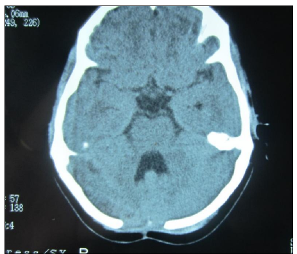
Figure-2: Immediate Post-operaive CT scan. Cranial defect (arrow) can be seen with no evidence of tumour and normal location of 4th ventricle after tumour resection