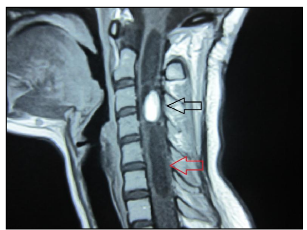
Figure-4: Metachronous tumour in the cervical spine, on follow up surveillance MRI, after 5 years of cerebellar hemangioblastoma resection. Mural nodule with contrast enhancement (black arrow) and cystic component (red arrow) are clearly visible.