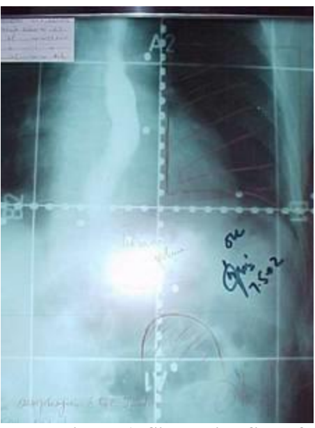
Figure-1: Simulation film of AP/PA field to 40 Gy. Lower border covers the celiac axis DISCUSSION

Locally advanced esophageal carcinoma (Stage III/IV) is un-resectable disease and caries a poor prognosis. <sup>1</sup> Curative surgery of thoracic esophageal cancer involves a subtotal or total esophagectomy. Surgery has been the standard treatment for thoracic esophageal carcinoma, but two largest series by Erlam and Cunha-Melo<sup>7</sup>, review 122 papers involving more than 83,000 patients treated primarily by surgery. The overall 5-year survival rate for patients with resected tumors was 12 %. Patients treated with palliative intention had a survival range of 2-6 months. Studies by Walsh et al<sup>8</sup> and Urba et al<sup>9</sup> report 6 % and 15 % 3 year survival in the surgery alone arm, respectively.