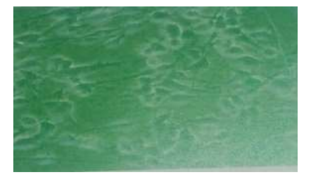
Fig II: 24Hrs phase contrast photomicrograph of glioma dissociated cells showing many bipolar & some rounded SC along with debri. OMx200.

(a) The weight (mg/animal) given are that of fresh, wet and stripped tissue., (b) No. of animals in each experiment were 8 (fresh) & 5 (glioma) on average, (c) Figures in parenthesis arc number of experiments, (d) In case of DRG minimum of 60 ganglia (minimum of 3 animals for each experiment) were obtained from one animal.