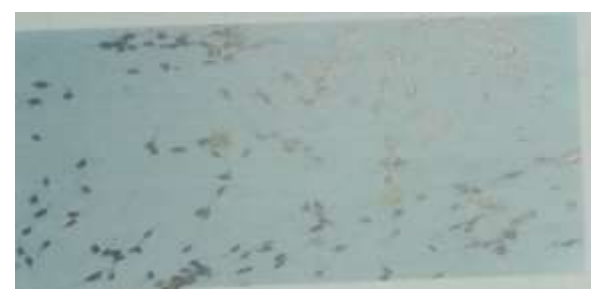
Fig III: 24Hrs culture from CP SN (8Wks) showing SC with different morphologies & unstained FB (LMN: ABC method). OMx100 \,