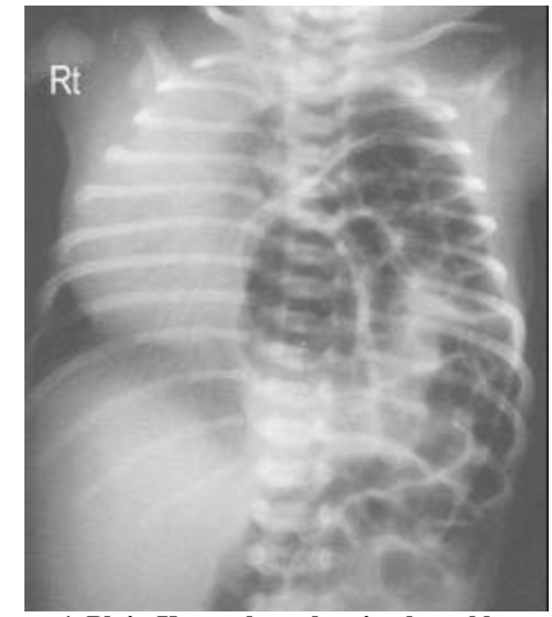
Figure 1. Plain X-ray chest showing bowel loops In the left hemithorax

reinforced and a partial anterior wrap fundoplication was performed and in the child with MH, the defect was repaired and diaphragm was sutured to the underside of the posterior rectus sheath at the costal margin after reduction of its contents and excision of the sac.