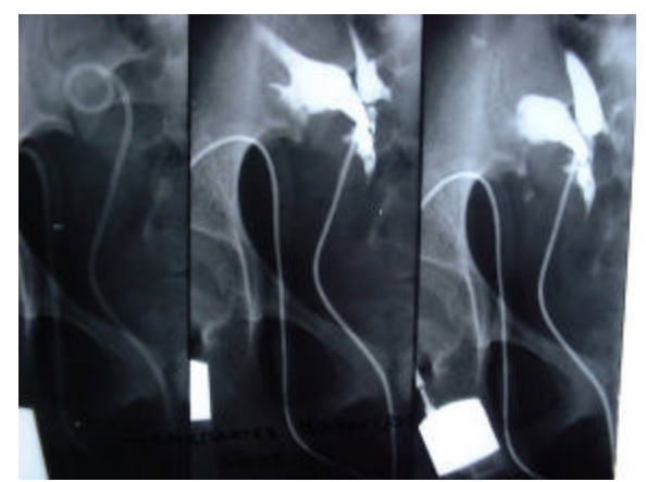
Figure 3. Persistent leakage from the renal pelvis