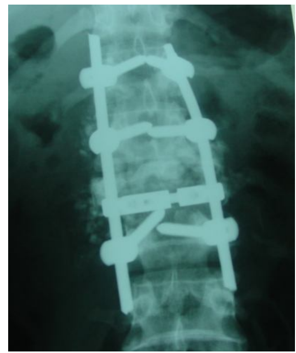
Figure-2: Post-op x-rays showing satisfactory reduction

There was 1 patient (5%) with wound infection and implant failure, which was removed 5 months postoperatively. Bony fusion had occurred at the time of removal of implant. One patient developed DVT. One patient became severely depressed and required long term antidepressants. None of the patients developed bedsores or other complications of recumbency. All the paraplegics could mobilize with zimmers frame independently and could pass urine using crede manoeuvre.