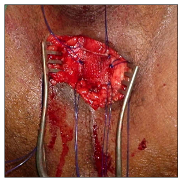
Figure-4: Mesh is Tightened until flow stops.