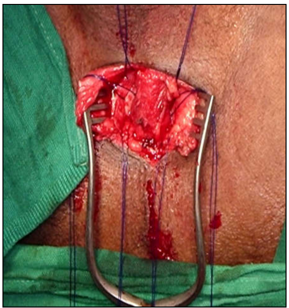
Figure-2: Three 1/0 Prolene sutures taken through periostium on each side.