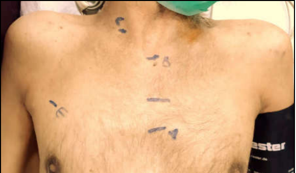
Figure-2: Mark A is 4 cm below manubriostternal notch, Mark B is mid-point of sternal notch, Mark C is puncture site, Mark D (not shown here) is depth of vein from puncture point measured with ultrasound guidance. All measurements are added and suitable length TCC selected and remaining length (at least 6cm) is Mark E which is length of tunnel.