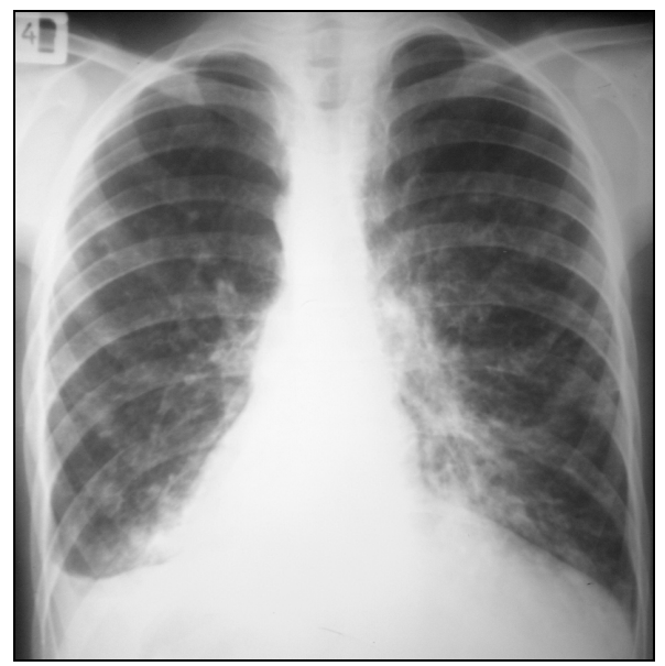
Figure-3: Chest X-ray of case-2

because of it. On examination, patient appeared distressed and short of breath while sitting. Grade-3 clubbing was present. He was cyanosed. Chest examination revealed apex beat in right 5<sup>th</sup> intercostal space and bilateral coarse crepitations in the lower part of chest. X-ray showed heart in right side of the chest. An ECG confirmed the presence of dextrocardia and a subsequent echocardiography moderate RV systolic dysfunction and severe pulmonary hypertension were noted. CT scan chest showed extensive bilateral bronchiectasis and situs inversus. Ultrasound Abdomen done and it also showed situs inversus.