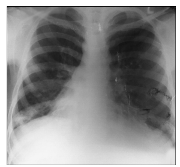
Figure-1: Chest X-ray of case-1.