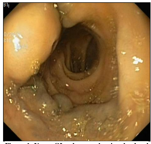
Figure-1: Upper GI endoscopy showing duodenal varices

cyanoacrylate. Lipodoil was used initially to flush the needle and later to push cyanoacrylate. No immediate complication occurred. Post-endoscopy X-ray erect abdomen was done showing cyanoacrylate in the region of duodenum within varix (Figure-2). The patient's final diagnosis was non-cirrhotic portal hypertension secondary to portal vein thrombosis. His thrombophilia profile was normal. The patient was discharged after a week of hospital admission in stable condition. Patient was followed up after 4 weeks and didn't have hematemesis or melena during this period.