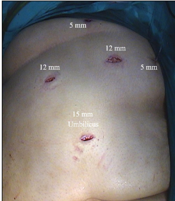
Figure-1: Port position on the patient