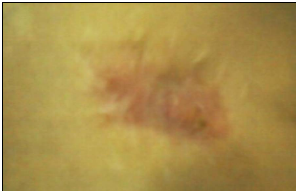
Figure-3: Wound at 3 rd month after 2 nd operation (ready to erode again)