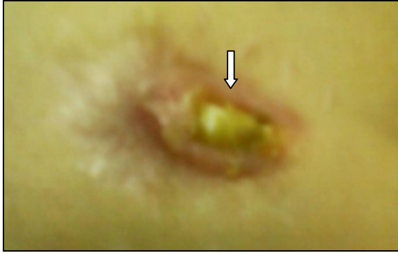
Figure-1: Lead erosion; lead sleeve is visible at the pacemaker implantation site (arrow)