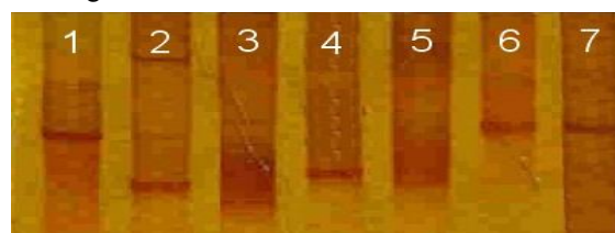
Figure 1: Polyacrylamide gel electrophoresis of amplified Ig gene rearrangement

MRD status at the end of induction showed that 28 (56%) patients were positive for MRD at the end of induction, 17 (34%) were negative for MRD, 2 (4%) patients died during induction therapy, and 3 (6%) patients were lost to follow up. In view of these results 28 (56%) patients who were morphologically in remission showed positive immunoglobulin gene rearrangement on PCR.