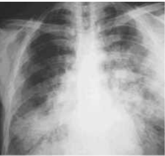
Figure-1: Bilateral symmetrical opacification in mid and lower lung zones

Spirometry revealed restrictive pattern. Blood CP with absolute eosinophil count was normal. LFT's and RFT's were normal. ANF and RA-factors, HCV and Hbs-Ag were negative. Oxygen saturation was 88%. Echo done was normal. PT, and APTT were in normal range. CT Scan Chest Showed a geographical pattern of ground glass appearance with superimposed interlobular septal thickening consistent with crazy paving appearance.