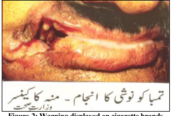
Figure-2: Warning displayed on cigarette brands

The cigarette sellers were asked for the attributes of their daily customers. The results showed that every day around 125 customers belonging to different age and gender buy cigarettes in different quantities. Majority (115, 92.0%) of the customers were male while only 10 (8%) were female. The majority (72, 57.6%) of the customers were in age group 20–40 years, followed by 26 (20.8%) in 41–60 years age group, and below 20 years age group was (5.6%) (Table-1).