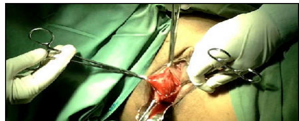
Figure-3: Resection of redundant tissue