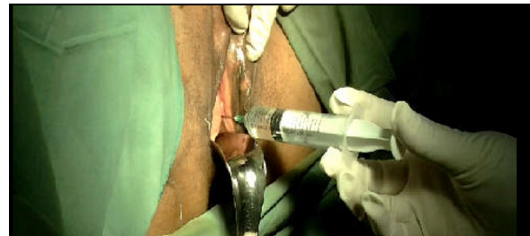
Figure-1: Local anaesthesia

All baseline investigations were normal. ECG showed left bundle branch block (LBBB). Anaesthetist declined to give Anaesthesia due to cardiac problem. We planned minimal surgery under local anaesthesia. Lefort's Colpocliesis done under local anaesthesia by the Professor (Figures 1-4). She was sent home with healthy wound.