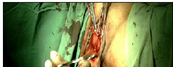
Figure-4: Approximation of anterior & posterior vaginal wall