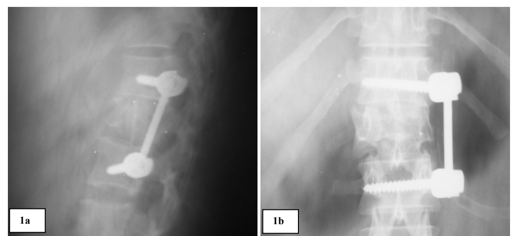
Figure-1a & b: Post-operative AP and Lateral X-Rays showing Anterior Vertebral body screws and rods in Traumatic L<sub>1</sub> burst fracture