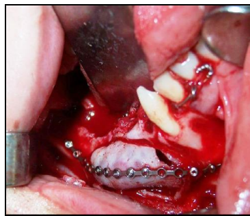
Figure-3: Insertion of the reconstruction plate.