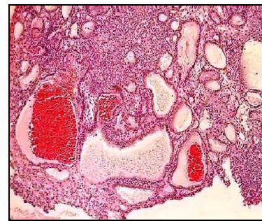
Figure-4: Anastomosing cords of ameloblastomatous epithelium with highly vascular stroma showing large spaces filled with blood. (Haematoxylin and eosin staining X20)

Citation: Bajpai M. Haemangiomatous ameloblastoma of mandible associated with impacted third molar simulating uni-cystic ameloblastoma. J Ayub Med Coll Abbottabad 2018;30(4):623-4.