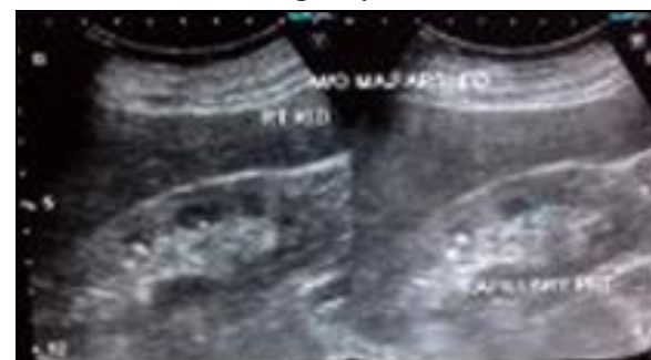
Figure-3: Both kidneys showing echogenic foci