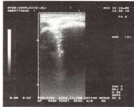
Fig. 1. Sonogram showing trichobezoar as echogenic area to the left of spine showing acoustic shadowing.

As rest of the organs were found normal morphologically. Barium meal showed typical filling defect consistent with trichobezoar. (Fig. 2)