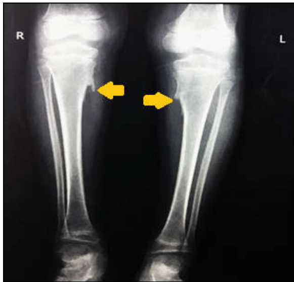
Figures-9: The radiograph of tibia & fibula showing bilateral medial tibial osteochondromas.

The radiograph of both tibia and fibula revealed medial tibial osteochondromas bilaterally. (Figure 9) Based on the history, examination and investigation a diagnosis of fibro dysplasia ossificans progressive was made.