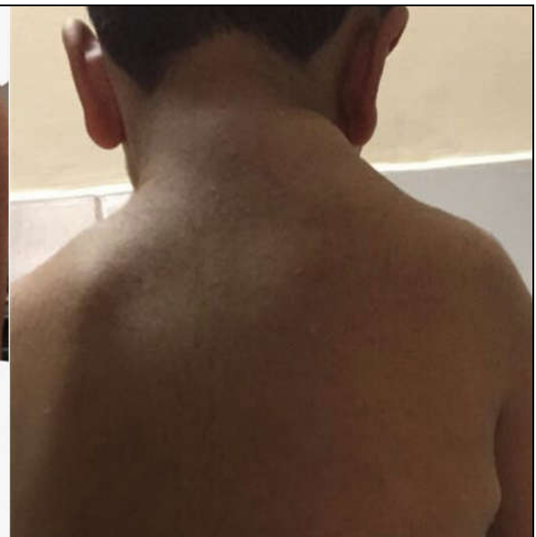
Figure-4: Shows swellings on right side of neck.