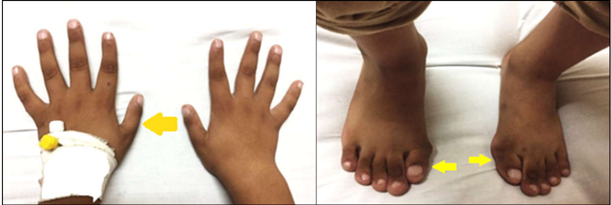
Figures-1 and 2: Clinical photograph showing aplasia of distal phalanges of both thumbs and bilateral hallux valgus deformity of big toes.