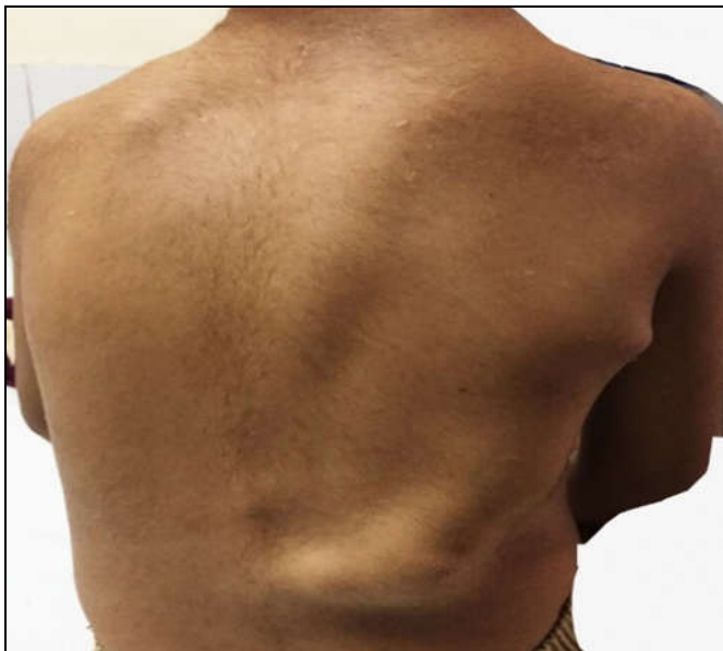
Figure-3: Shows clinical photograph showing multiple swellings on the right side of chest and back