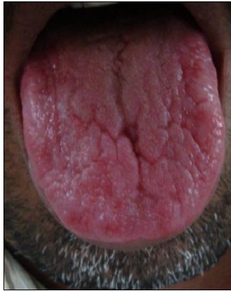
Figure-2: Scrotal tongue