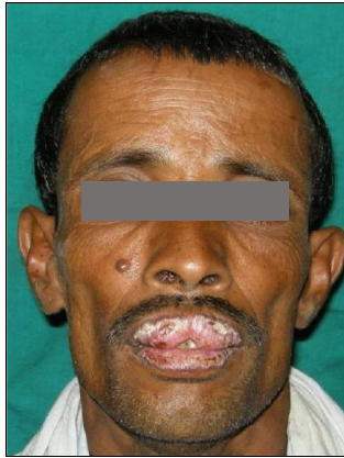
Figure-1: Swollen lips with cracking surfaces

Department of Oral and Maxillofacial Pathology, NIMS Dental College, Jaipur, Rajasthan-India