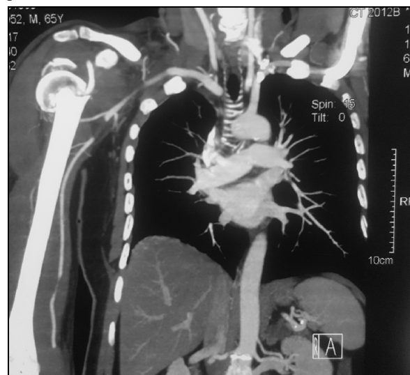
Figure-1: CTA showing filling defect (complete occlusion) in axillary artery with distal filling of contrast through collaterals.

axillary artery with distal filling of contrast via collaterals [Figure-1]. A joint decision was made by orthopaedic and vascular team to explore and treat both the fracture and vascular injury at the same time. Firstly, the orthopaedic team fixed the proximal humerus fracture with PHILOS™ Plating System. Following that, the axilla was approached through same incision. There was 3 cm contused segment with intravascular thrombosis and absent flow [Figure-2]. The axillary artery segment was resected and continuity was restored with an interposition reverse saphenous vein graft in end to end configuration [Figure-3]. Patient had distal pulses restored immediately after the anastomosis. Since there was no evidence of compartment syndrome fasciotomy was not done. His post-operative recovery was uneventful and he was discharged on 3rd postoperative day. Two weeks follow up showed satisfactory wound healing and palpable radial pulse with no neurovascular deficit.