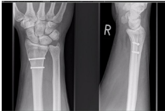
Figure-2: Intraoperative images showing fixation with two partially threaded 3.5 screws. The fracture was initially stabilized with 1.6 mm K-wire to prevent displacement during insertion of screws