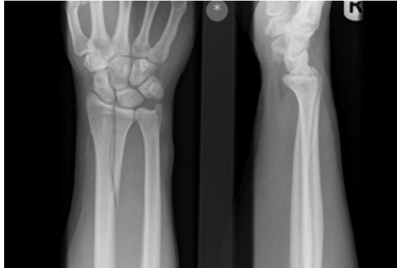
Figure-1: AP and lateral radiographs, showing vertical fracture of distal radius

Patient was followed at one year and then at two years with wrist X-rays (Figure 5 and 6), at that point he was discharged from the fracture clinic. Apart from the initial paraesthesia of superficial radial nerve, no other complication was noted.