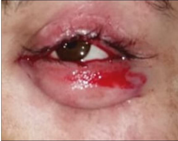
Figure-4: Silicone bolsters within the inferior fornix with formation of the lower lid sulcus and ocular prosthesis in place