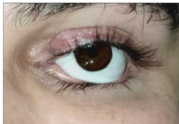
Figure-2: Improperly fitted ocular prosthesis