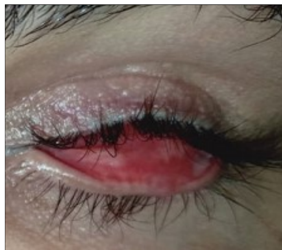
Figure -3: Contracted anophthalmic socket with shallow fornix