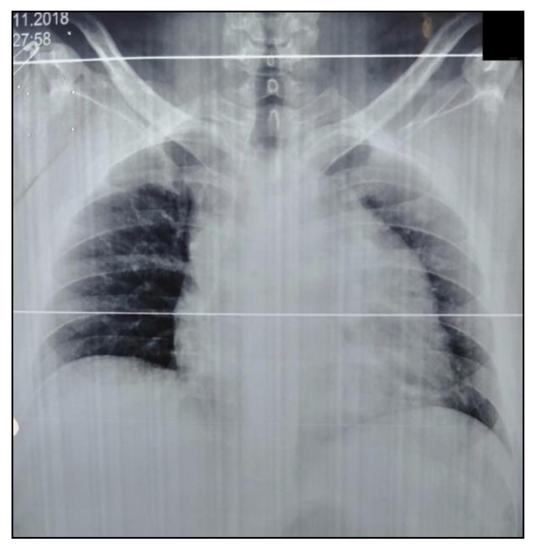
Figure-1: Chest X ray showing enlarged cardiac silhouette