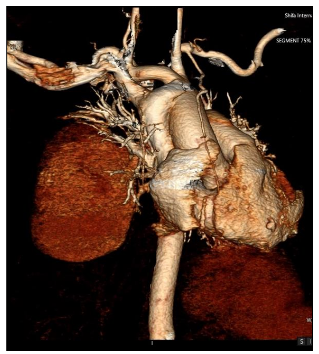
Figure 3: 3-D reconstructed images confirming the pseudoaneurysm