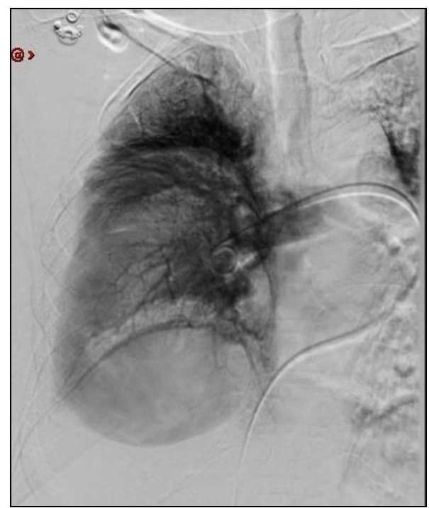
Figure-2: Fluoroscopic AP image of catheter angiography showing large right sided pulmonary aneurysm