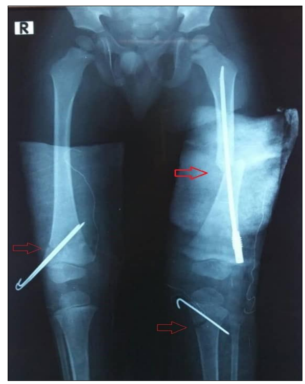
Figure-3: Post-operative plain radiograph of bilateral lower extremities in AP view showing right sided supracondylar femur fracture and left sided proximal tibial fracture fixed with K-Wires and left sided femur fracture fixed by CRIF with a flexible nail