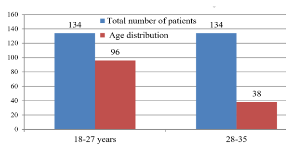
Figure-1: Age Distribution Mean age was 30 years with SD±10.

(Figure-1). Eighty-two (61%) patients had POG range <34 weeks while 52 (39%) patients had POG range >34 weeks. The mean POG was 35 (SD \pm 5.31) weeks (Table-1). Forty-eight (36%) patients had BMI <27 Kg/m^2 while 86 (64%) patients had BMI >27 Kg/m^2 . Mean BMI was 27 Kg/m<sup>2</sup> (SD±5.12) (Table-2). Fiftysix (42%) patients had a positive history of hypertension while 78 (58%) patients had a negative history of hypertension (Table-3). One hundred and two (76%) patients were primigravidas while 32 (24%) patients were multigravidas (Figure-2). Stratification of primigravidas with respect to age, gestational age, BMI and history of hypertension was done. Out of 102 primigravidas patients 73 (76.04%) were in the age range 18-27 years while 29 (76.31%) were in the age range 28-35 years (Table-4). Most of the eclamptic primigravidas presented at or below 34 weeks of Gestation 62 (75.60%) (Table-5). Sixty-six (76.74%) patients were overweight with BMI greater than 27kg/m<sup>2</sup> (Table-6). Forty-two out of 102 primigravidas with eclampsia had a significant past history of hypertension (Table-7). Post-stratification results were not statistically significant.