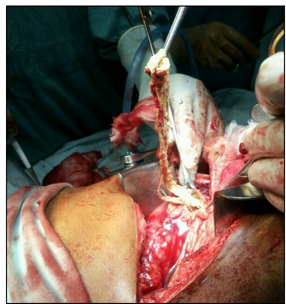
Figure-2: Exploration of the renal cavity and removal of gauze piece with cyst wall