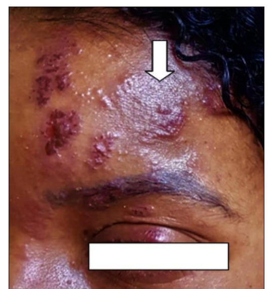
Figure 3: Diagnosis of herpes zoster 20 days postdischarge.

The scan shows diffuse consolidations in the left hemithorax, featuring multiple cavitations and an adjacent tree-in-bud pattern. This is consistent with active granulomatous disease with endobronchial dissemination.