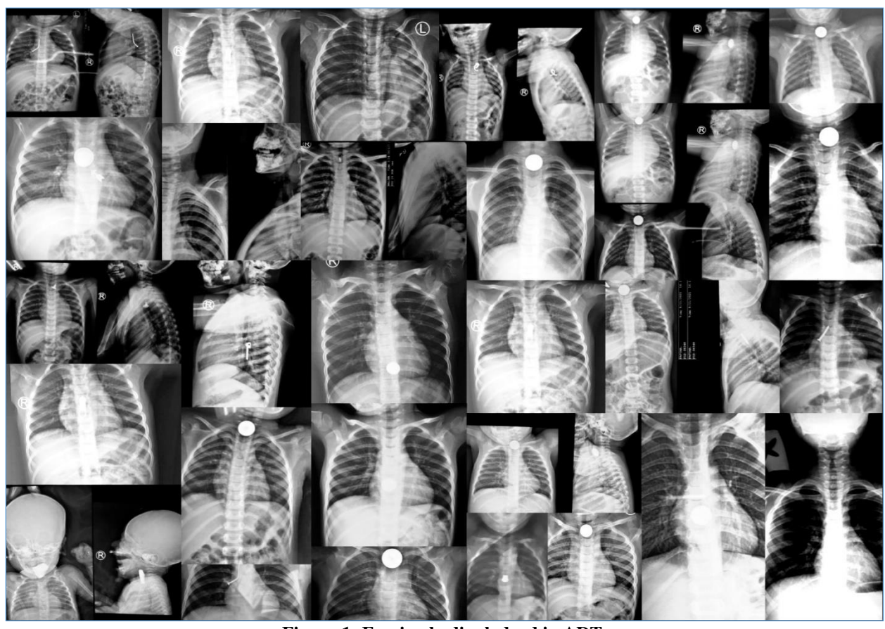
Figure-1: Foreign bodies lodged in ADT

Our study aimed to evaluate and determine the outcomes of foreign bodies lodged in the ADT at our paediatric surgery department and to compare this data in ingestion and aspiration groups. And to attract the attention of caregivers and parents regarding the dangers of foreign body ingestion.