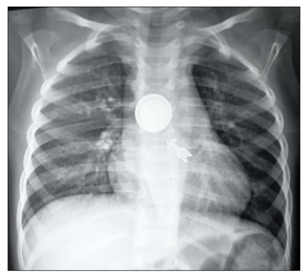
Figure 3: A button battery in the mid-oesophagus (note the halo sign)

radiopaque density whereas a button battery will produce a halo sign. Figure 3