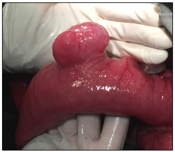
Figure-2: Size of diverticulum