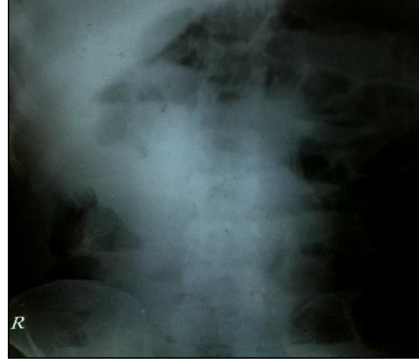
Figure-1: X-Ray erect abdomen showing multiple gas shadows

The patient's condition was not improving and he underwent laparotomy on the second day of admission. Upon exploration, we found dilated whole small gut volvulus and multiple diffuse giant diverticula starting from 2 feet distal to duodeno-jejunal junction, involving whole of the jejunum and the proximal portion of ileum, with about 700 ml of reactionary fluid in the abdomen. The malrorated gut was viable. The diverticula ranged in size from that of a golf ball and larger. They were multiple and uncomplicated. Derotation of volvulus was done, with no resection. The patient went into ileus for 4 days post op with normal electrolytes and laboratory investigations and was managed conservatively. Later on the post-operative course was uneventful.