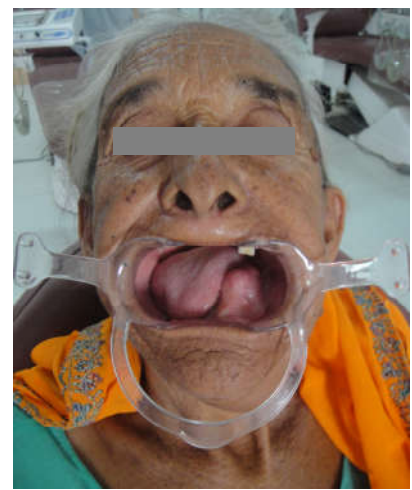
Swelling on the lower left back region of the jaw

Department of Oral and Maxillofacial Pathology, NIMS Dental College, Jaipur-India