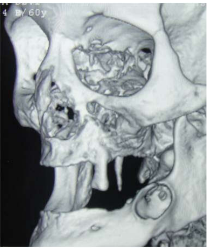
CT Scan with 3D reconstruction