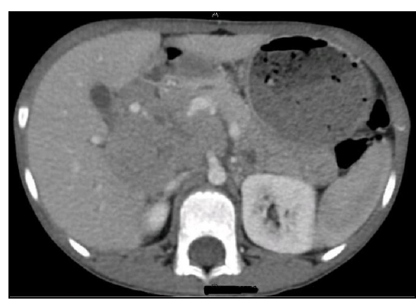
Figure-1: Lobulated mass with good cleavage plane. Note encasement of major vessels with normal contrast opacification

bile duct was encased by this lesion however proximal part was normal in calibre measuring 0.6 cm. Mild intrahepatic biliary dilatation was present. (Figure-3). There was no evidence of significant abdominal lymphadenopathy or metastasis to liver, lungs or bones on this examination.