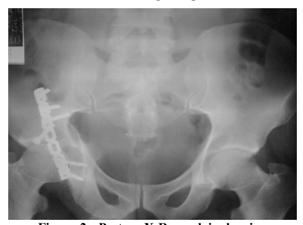
Figure-2: Post-op X-Ray pelvis showing reconstruction plate