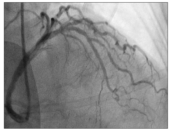
Figure-6: LAO caudal 38, 40 degrees