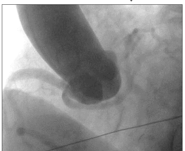
Figure-4: Aortogram: LAO 30° aortogram revealing the origin of the left coronary and right coronary arteries