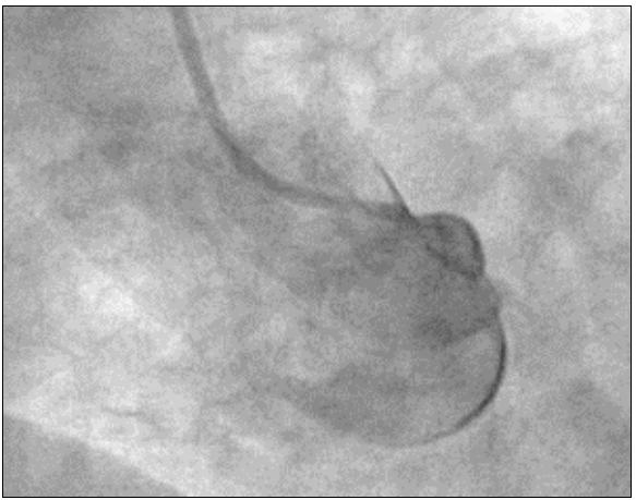
Figure-3: Coronary Angiogram: Left Anterior Oblique (LAO) 30° - Left coronary artery not seen to arise from the left coronary sinus.