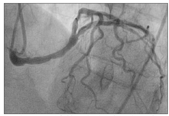
Figure-7: LAO 30 projection. Selective Left Coronary Artery cannulation