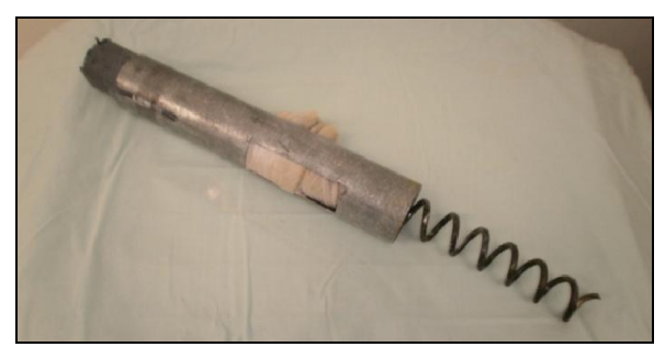
Figure-3: Foreign body after removal