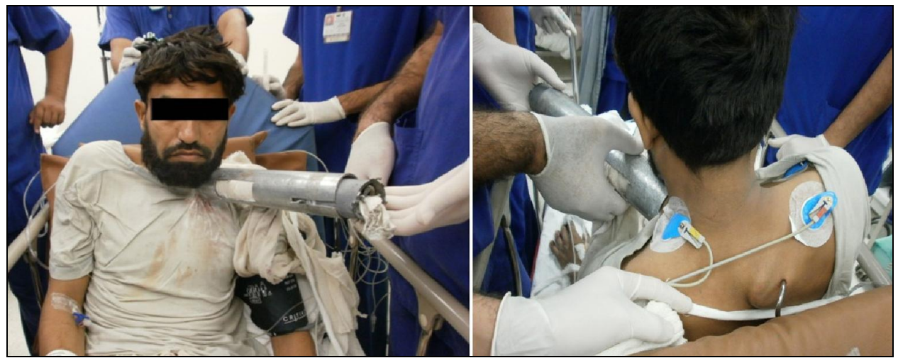
Figure-1: Foreign body; anterior and posterior view