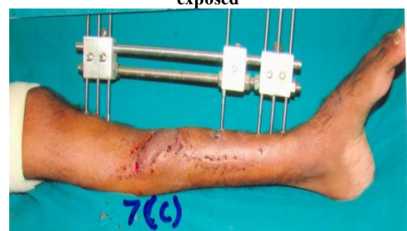
Figure-7(C): Post operative picture 03 weeks after coverage with medial hemisoleus muscle flap and skin grafting. Primary wound healing was achieved.