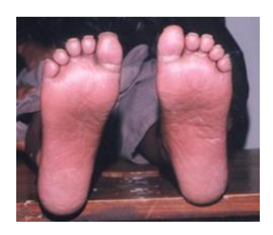
Figure-2: Yellow colored hyperkeratotic areas on soles