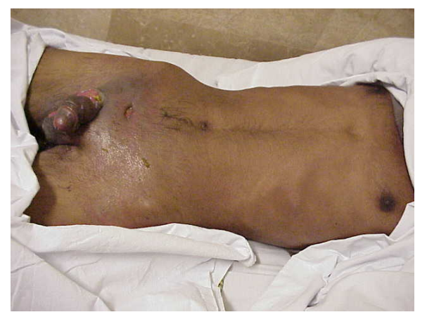
Fig.1: Close up photograph of patient

Surgical intervention is regarded as one of the major causes of development of fecal fistula in adults.<sup>5, 8,9</sup> The use of prosthetic material has been reported as the cause of fecal fistula in some studies<sup>9</sup>. Repeated treatment of scrotal hernia by native doctor has also been reported as a cause of multiple urinary and fecal fistulae in one study.<sup>8</sup> The incision of hernia by herbalists as well as intervention by quacks has been reported as the cause of fecal fistula in adults.<sup>5</sup> None of these interventions was observed as a cause of fecal fistula in our patient.