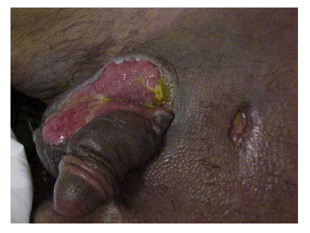
Fig.2:Second close up photograph of patient showing scrotal and supra-pubic sites of fecal fistulae