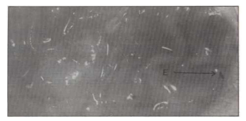
FIGURE 1: Photograph of gastric mucosa showing areas of erosions (E), marked by brownish black pigment in an animal treated with fenopron. (Photograph x 10).