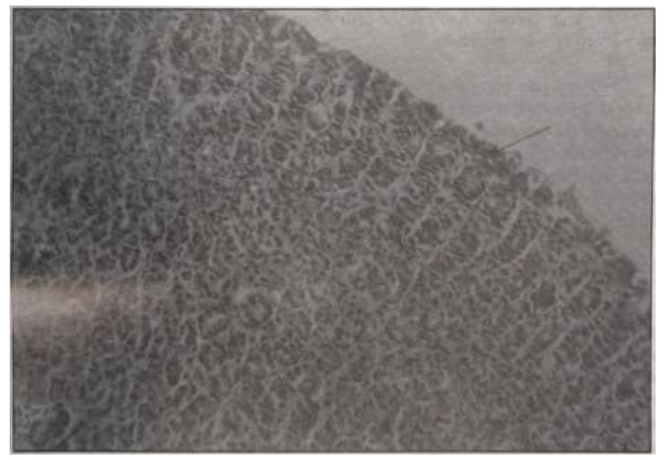
FIGURE 4: Section of gastric mucosa stained with H & E showing flattening of surface epithelial lining with pyknotic nuclei (arrow) in an animal treated with paracetamol followed by fenopron. (Photomicrograph x 160).

FIGURE 3: Showing section of the stomach stained PA.S.; showing an acute erosion (E) with mucous contents (M) in an animal treated with fenopron. (Photomicrograph x 64)