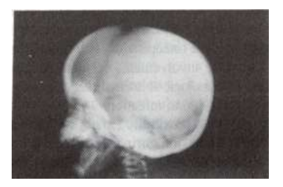
Fig. 4 X-Ray skull of an osteopetrotic child.

Increased radiodensity of the base of the skull was found in 60% of patients (Fig 4). Fracture of bone was not found in a single patient.