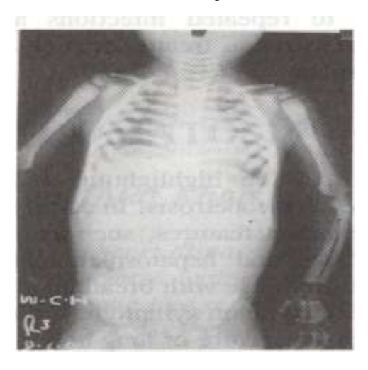
fig 2. Skeletal radiograph of an osteopetrotic child

All patients were moderately to severely anaemic and underweight (Fig 1). They had normal serum values of calcium and phosphate but alkaline phosphatase was raised in majority of patients. Bone marrow aspiration was done in 2 patients, one was normal and the other was difficult to aspirate, hi majority of cases, parents did not allow for aspiration of bone marrow. In all cases, increased radiodensity of skeletal radiographs was observed which was the only- diagnostic criteria for this disease (Fig 2).