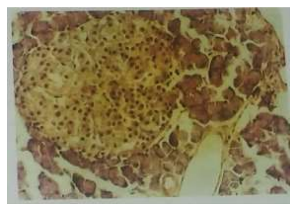
Figure 2: Photomicrograph of pancreas from group E showing an islet of Langerhans with normal number of p-cells arranged centrally \ h intact cytoplasmic and nuclear morphology. X 500

The animals in experimental group D showed a gain in their body weight but this was not significant statistically. Their general condition however appeared to be satisfactory.