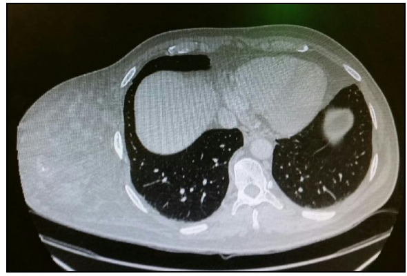
Figure-1: CT- Scan Image of the right chest mass.

notably present throughout within this vascular proliferation in close association with adipose tissue. The surrounding skeletal muscle fibres and nerve fibres are unremarkable. Focal scar formation is noted in the overlying skin. Arborizing, plexiform capillary network with thin-walled vessels, and single clear fat vacuoles appear to be consistent with myxoid liposarcoma.