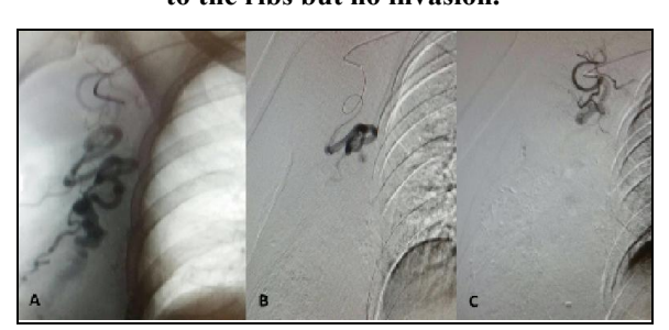
Figure-3. A- Angiogram of long thoracic artery prior to embolization, B- Embolization of lateral thoracic artery through interventional radiology, C- Angiogram of lateral