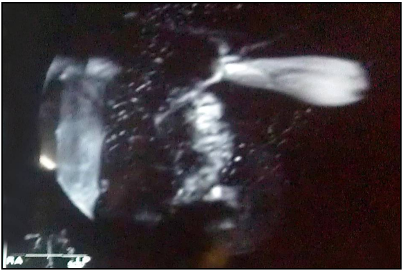
Figure-3: T2 weighted coronal image showing a linear smooth edged hypo-intense band in the gallbladder