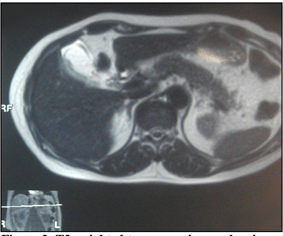
Figure 2: T2 weighted transverse image showing a hypo-intense band looping along the wall of gallbladder, involving the cystic duct