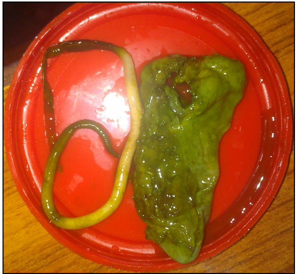
Figure-4: Gross specimen of gallbladder and Ascaris lumbricoides after laparoscopic cholecystectomy