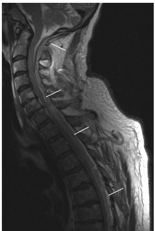
Figure I: MRI cervicothoracic spine, posteriorly located Extensive epidural abscess (Arrows) extending from Foramen Magnum into the thoracic spine