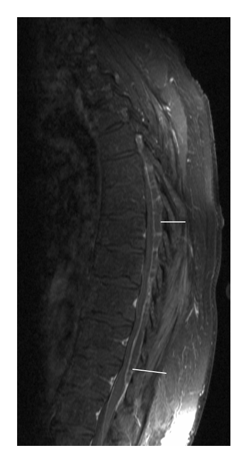
Figure III: MRI of the thoracolumbar spine, posteriorly located abscess extending all the way to thoracolumbar region.