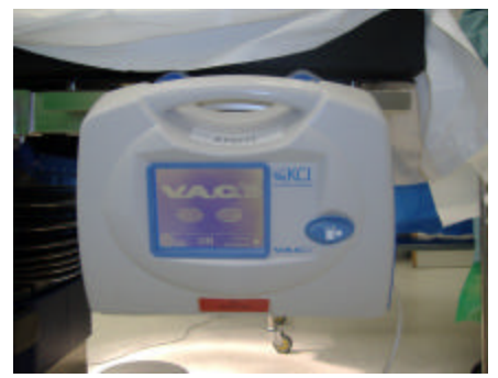
Figure 3. VAC device