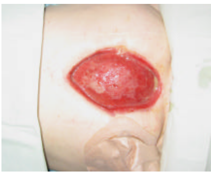
Figure 4. Granulating wound