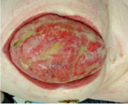
Figure 1. Open laparostomy wound

Fluid within the wound is taken up by the foam and transported into the disposable container within the main vacuum unit.