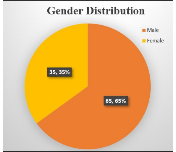
Figure-1: Gender distribution among patients

Comparing the means for functional outcome in anterior circulation using independent t test score, a lower baseline NIHSS score was independently predictive of a favourable outcome for patients with AC (OR 1.268, 95% CI 1.76 – 1.358) and PC (OR 1.534, 95% CI 1.321–1.891) stroke.