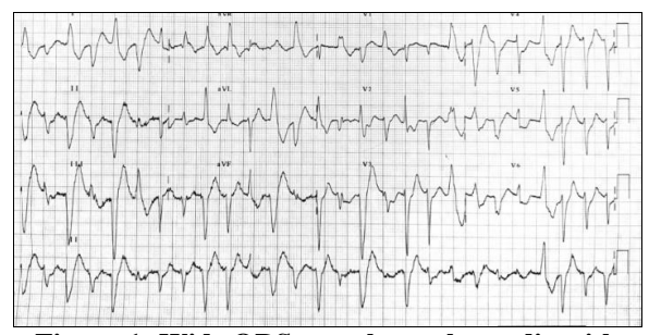
Figure-1: Wide QRS complex tachycardia with beat to-beat change in the morphology and axis of the QRS complexes consistent with bidirectional ventricular tachycardia

followed later by ventricular escape rhythm at a rate of 20 - 25beats/min. (Figure-3). Immediate cardiopulmonary resuscitation (CPR) was instituted, and patient was intubated and put on mechanical ventilation. Temporary transvenous pacing was commenced. Unfortunately, the patient had aspirated gastric contents during intubation attempts; hence broad-spectrum IV antibiotics were initiated, and supportive care was continued. Following this event, the patient developed hypotension and vasopressors were started. After 2 hours, the patient again developed asystole with ventricular standstill, the asystole was refractory to treatment with atropine, he did not respond to 25 minutes of effective CPR and was finally declared expired.